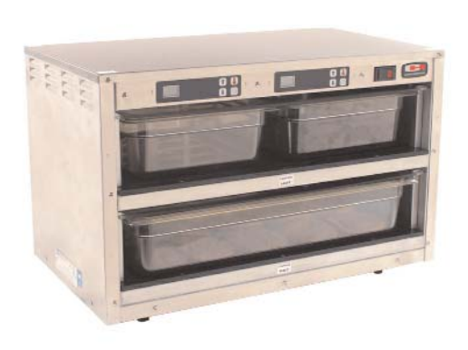
MC212S-4 for 4" deep pans Shown with one full size and two half-size pans (not included)

Since 1947, Foodservice Equipment That Delivers!