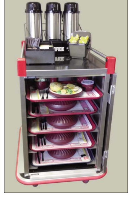
PSDTT10 (shown with optional coffee & tea service)

Since 1947, Foodservice Equipment That Delivers!