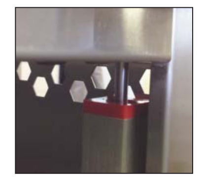
ULTRA-QUIET RACKS... with adjustable pin positions to accommodate a variety of tray sizes. Tray spacing fixed on standard 5.75" centers.