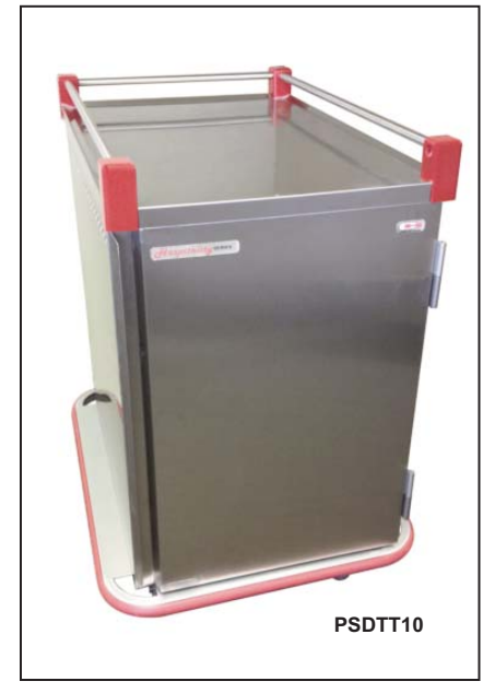
VENTED END PANELS... Allow excess heat and moisture build-up to escape, while maintaining highest food quality.

Heavy-duty, 12 gauge hinges with 3/8" diameter pin for trouble-free door operation. 270 degree door swing.