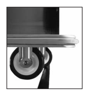
WHEEL-AHEAD CASTER CONFIGURATION... Mounted to base in offset wheel-ahead pattern for easy rolling over uneven surfaces. Allow for easy handling and steering.

PERFORMA CASTERS WITH NOISE SUPPRESSION BEARING COVERS... 6" diameter industrial grade casters with non-marking red rubber cushioned tread. Rust resistant Delrin bearings with cart wash resistant Glacier FM grease. Long lasting and easy rolling, yet durable enough to withstand rigorous cart wash programs. Two fixed and two swivel casters for easy maneuvering.