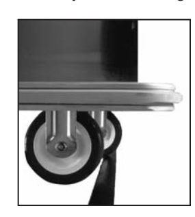
WHEEL-AHEAD CASTER CONFIGURATION... Mounted to base in offset wheel-ahead pattern for easy rolling over uneven surfaces. Allow for easy handling and steering.

PERFORMA CASTERS WITH NOISE SUPPRESSION BEARING COVERS... 6" diameter industrial grade casters with non-marking red rubber cushioned tread. Rust resistant Delrin bearings with cart wash resistant Glacier FM grease. Long lasting and easy rolling, yet durable enough to withstand rigorous cart wash programs. Two fixed and two swivel casters for easy maneuvering.