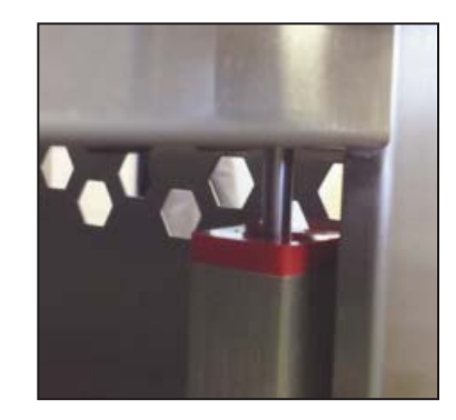
ULTRA-QUIET RACKS... with adjustable pin positions to accommodate a variety of tray sizes. Tray spacing fixed on standard 5.75" centers.