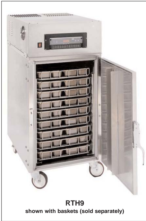
RTH9 shown with baskets (sold separately)

Since 1947, Foodservice Equipment That Delivers!