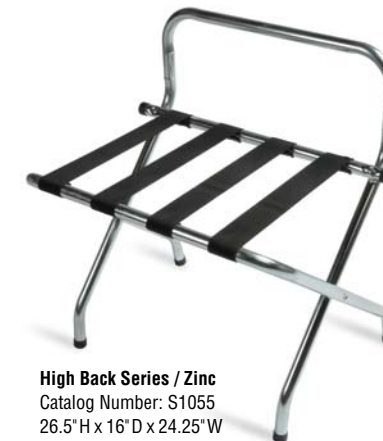
High Back Series / Zinc Catalog Number: S1055 26.5"H x 16"D x 24.25"W