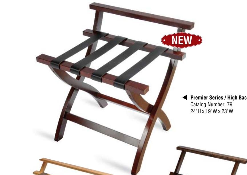
◀ Premier Series / High Back Catalog Number: 79 24"H x 19"W x 23"W