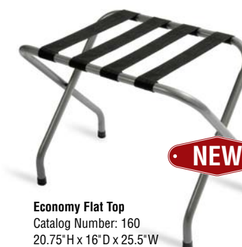
Economy Flat Top Catalog Number: 160 20.75"H x 16"D x 25.5"W