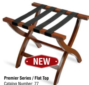
Premier Series / Flat Top Catalog Number: 77 19.25"H x 17"D x 23"W