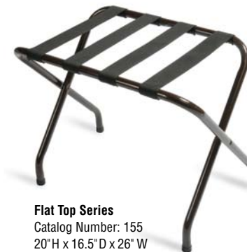
Flat Top Series Catalog Number: 155 20"H x 16.5"D x 26" W

Back Webbing Optional On All High Back Models.