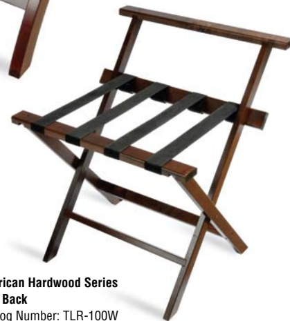
American Hardwood Series High Back Catalog Number: TLR-100W 25.5"H x 21.5"D x 22.5"W