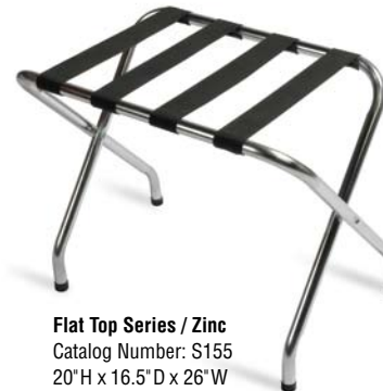
Flat Top Series / Zinc Catalog Number: S155 20"H x 16.5"D x 26" W