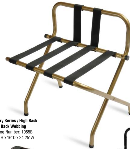
▶ Luxury Series / High Back With Back Webbing Catalog Number: 1055B 26.5"H x 16"D x 24.25"W

Protective Wall Bumpers Featured On All High Back Luggage Racks.