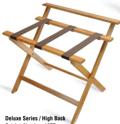
Deluxe Series / High Back Catalog Number: 1077 22.5"H x 18.5"D x 26"W