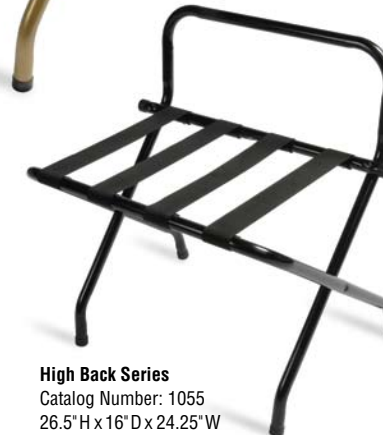
High Back Series Catalog Number: 1055 26.5"H x 16"D x 24.25"W