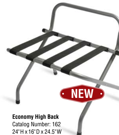
Economy High Back Catalog Number: 162 24"H x 16"D x 24.5"W