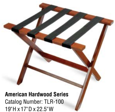
American Hardwood Series Catalog Number: TLR-100 19"H x 17"D x 22.5"W