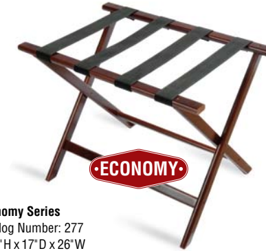
Economy Series Catalog Number: 277 19.5"H x 17"D x 26"W

Orders: 800.873.4370 Fax: 815.459.6562 Web: www.cs ltd.com CSL: 220-D Exchange Drive Crystal Lake, Illinois 60014