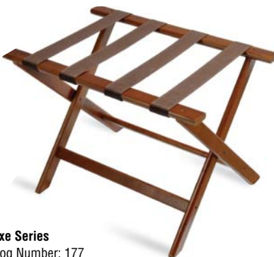
Deluxe Series Catalog Number: 177 18.5"H x 17"D x 26"W