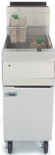
D50G Shown with optional casters.