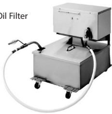
MF90/80 Micro-Flo Portable Oil Filter