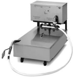
MF90/80LP Micro-Flo Portable Oil Filter