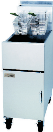
SM40G Shown with optional casters.