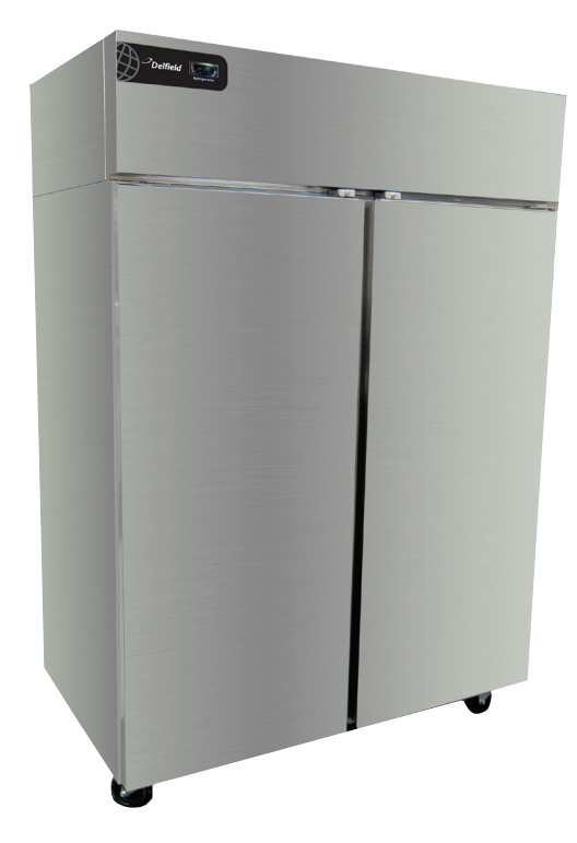
Global Series GCR2-S