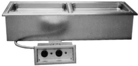
Model N8746N (Pans by others)