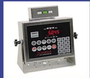
Optional checkweigher light bar for model 210.