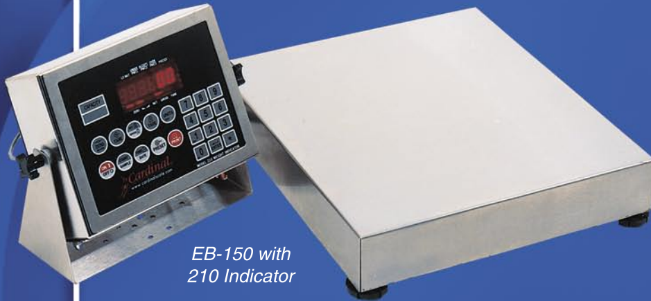
EB-150 with 210 Indicator

Designed for top performance and long-term accuracy.