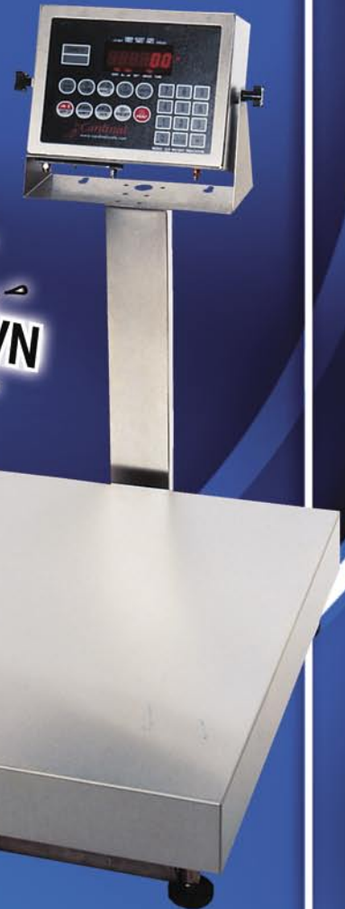
EB-300 with 210 Indicator