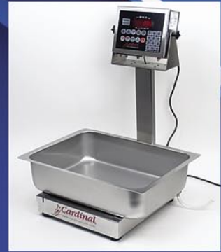
Optional commodity pan with built-in drain.

Whatever your needs may be, select from Cardinal's complete line of stainless steel bench scales.