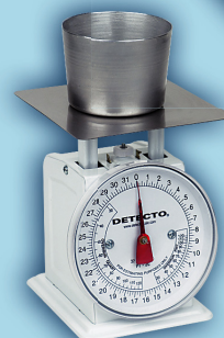
Model PT-2C with measuring cup and dial chart for overrun percentages

Dial Size: 6" / 15 cm diameter Platform Size: 7.875"W x 5.875"D / 20 cm W x 15 cm D stainless steel Overall Size: 5.25"W x 7.25"D x 7.5"H / 13 cm W x 18 cm D x 19 cm H Shipping Weight: 6 lb / 2.3 kg