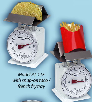
Model PT-1TF with snap-on taco / french fry tray

Dial Size: 6" / 15 cm diameter Platform Size: 7.875"W x 5.875"D / 20 cm W x 15 cm D stainless steel Overall Size: 5.25"W x 7.25"D x 7.5"H / 13 cm W x 18 cm D x 19 cm H Shipping Weight: 6 lb / 2.3 kg