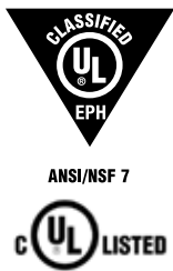
Item Number: DDXBC70