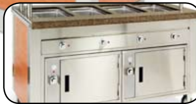
Heat-In-Base option for maximum efficiency.

Counter options and laminate panels available. Stainless steel panels standard.