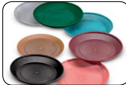
Power•Therm Bases (See Spec Sheet 112)