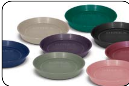
Smart•Therm & Turbo•Temp Induction Bases (See Spec Sheets 149 & 158)