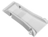
Wheel placement system