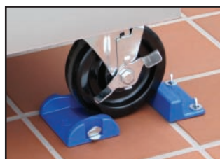
Thumb Screw Hardware Pack

Each Safety-Set system includes both the adhesive foam tape and the thumb screw hardware pack for your convenience.