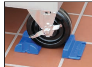
Adhesive Foam Tape