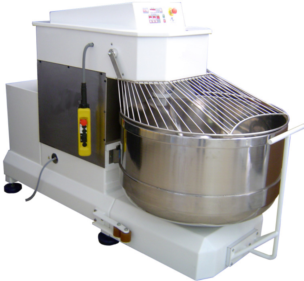
ATA100 - ATA150