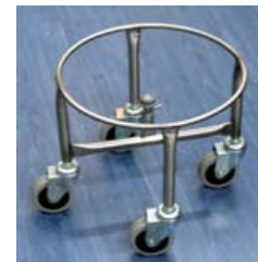
Stainless steel bowl dolly on casters (BTFP60D)