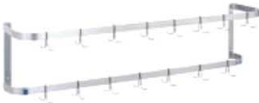
724 - Wall Hung