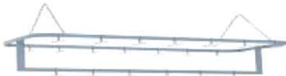
712-60-PG - Ceiling Hung