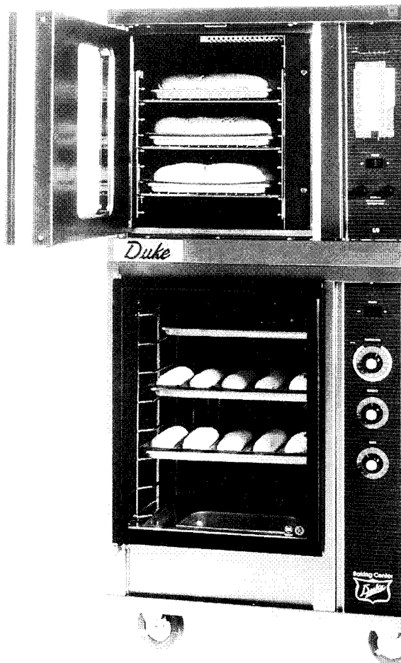
DBC-1 consisting of 59-E3ZZ/PFB-1 shown

Main on/off power switch. Solid state (RTD) temperature control from 85°-160°F, with 3 different zone settings; proof/warming/holding. Humidity is controlled through an infinite switched dial. Humidity range from zero to high. A one hour electric dial type timer, with continuous sounding buzzer is mounted on the control panel. A fractional HP fan blower gently circulates moist air throughout the proofer cabinet. Water reservoir holds 2 quarts of water.