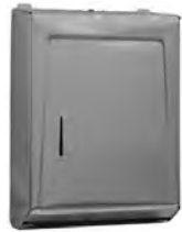
model #318496 towel dispenser

Hand Sink Accessories & Options—Miscellaneous