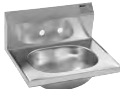
hand sink with electropolished finish

EAGLE GROUP 100 Industrial Boulevard, Clayton, DE 19938-8903 USA Phone: 302-653-3000 • Fax: 302-653-2065 www.eaglegrp.com