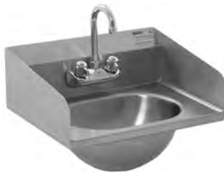
hand sink with optional end splashes