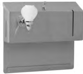
model #DP-10 towel dispenser