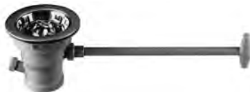
polymer rotary drain