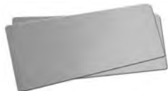
pair of end splashes for field installation