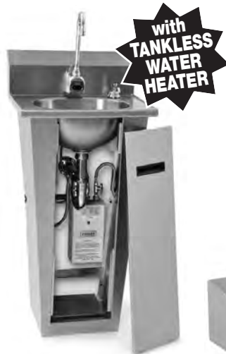
hand sink with hot water heater