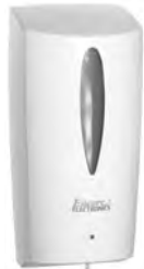
soap dispenser with electric eye