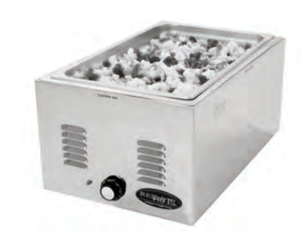
#1220FWD-120 food warmer with 12" x 20" well, shown with optional food pan

Eagle RedHots® Countertop Food Warmer, model ______. Highly polished exterior body, with deep drawn 304 stainless steel heat well. Infinite control with "On" indicator light, wet or dry operation.