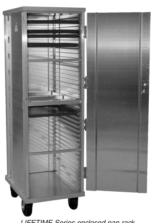
LIFETIME Series enclosed pan rack