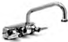
#313302 T&S faucet