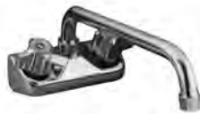
#303365 standard faucet