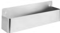
single-tier speed rail