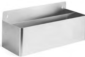
double-tier speed rail