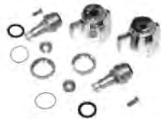
#313975 faucet repair kit