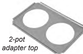
2-pot adapter top