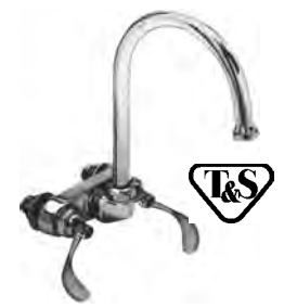
T&S splash mounted faucet with wrist handles