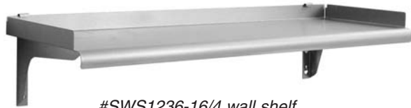
#SWS1236-16/4 wall shelf

Eagle Snap-n-Slide® Wall Shelf with "V" Marine Front Edge, model _____. Unit constructed of 16/430, 16/304, 14/304, or 14/316 stainless steel. "V" marine front edge with 1½" upturn on rear and ends. Stainless steel wall brackets are shipped loose for mounting directly to wall studs.