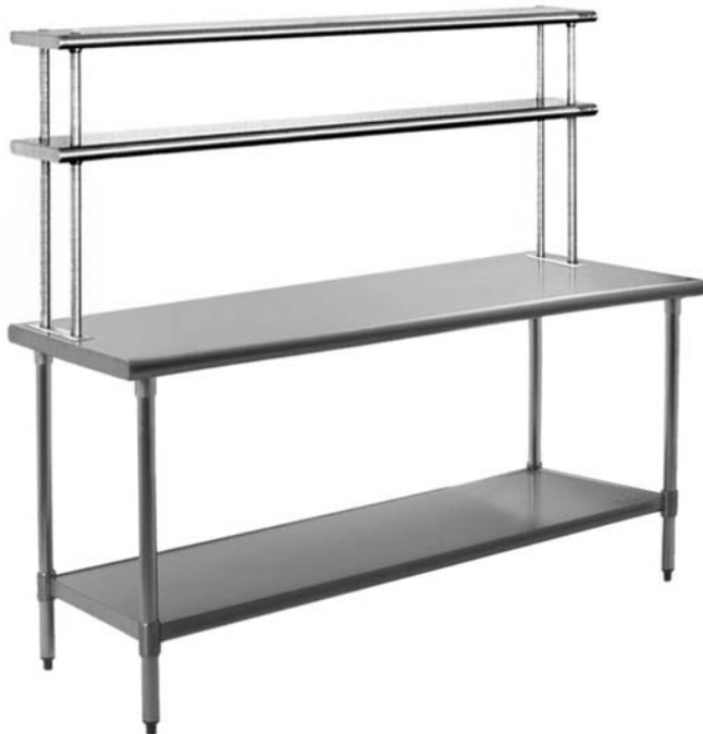
worktable shown with Flex-Master® overshelf system

Eagle Flex-Master® Overshelf System to consist of 10"- or 12"- wide shelves—16/430 or 16/304 stainless steel, adjustable in 1" increments without the use of tools. Shelves feature split sleeves with a tapered collar for mounting onto posts. Stainless steel posts include mounting plates. Optional stainless steel pot hooks and utility racks available.