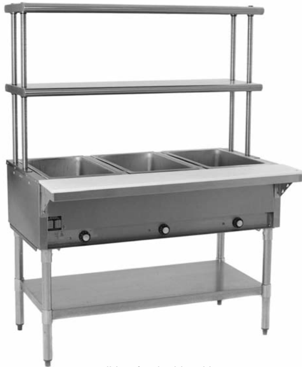
3-well hot food table with Flex-Master® Overshelf System

Eagle Flex-Master® Overshelf System for Hot Food Tables to consist of 10"- or 15"-wide 16/304 stainless steel shelves with tapered collars, adjustable in 1" increments. Shelves come with split sleeves. Posts are stainless steel, with mounting plates included. Optional stainless steel pot hooks, pot and ladle racks, and heat lamp brackets are available.