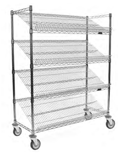
angled shelf/visual merchandising cart

Eagle Angle Shelf/Visual Merchandising Cart, model ________. (EAGLEbrite® Zinc, Chrome, Black Epoxy, Valu-Master® Gray Epoxy, Valu-Gard® Green Epoxy) reverse mat angled wire shelves with hangar rails. 3-sided truss assembly at top and bottom for increased strength. (EAGLEbrite® Zinc, Chrome Plated) posts with 5"-diameter resilient wheel casters.