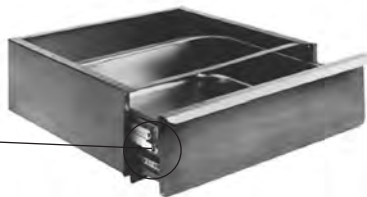
drawer assembly with NSF-approved slides