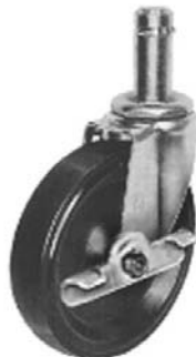
caster with locking brake

For example, model number UAR-64-A/ADG indicates a universal angle rack with the following accessories: locking brakes ("A"), perimeter bumper ("D"), and aluminum pan stop ("G").