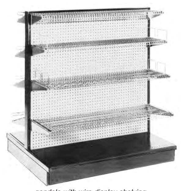
gondola with wire display shelving

Eagle Wire Display Shelving, model ______. Consists of shelf and pair of brackets. For use on all major shelving fixtures. Brackets are tier-notched to hold shelf in place. Shelves are zinc plated.