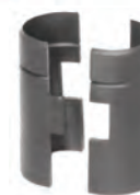
plastic conductive split sleeves