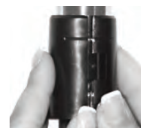
plastic split sleeve