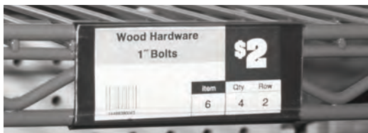
black plastic label holder