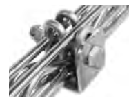
security "S" hook