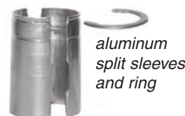
aluminum split sleeves and ring