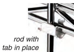
rod with tab in place