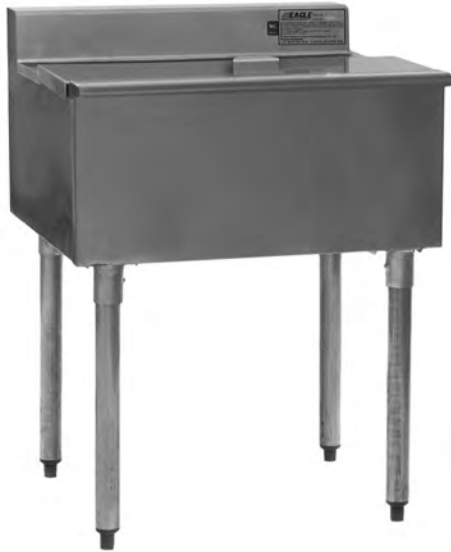
#B2IC-18 ice chest

Eagle 1800 Series Ice Chests, model _____. Top, front, backsplash, ice bin and sliding cover to be heavy gauge type 304 stainless steel. Fabricated ice bin is fully insulated with 1½" drain. 1½" O.D. galvanized tubular legs with adjustable bullet feet.