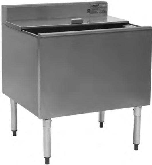
B301C-12D-22-7 ice chest

Eagle 2200 Series Ice Chests with Sealed-In Cold Plate, model _____. Top, front, backsplash and fabricated ice bin is heavy gauge type 304 stainless steel. Ice bin is fully insulated, with 1½" drain, and sealed-in 7-circuit cold plate. 1½" O.D. galvanized tubular legs with adjustable bullet feet.