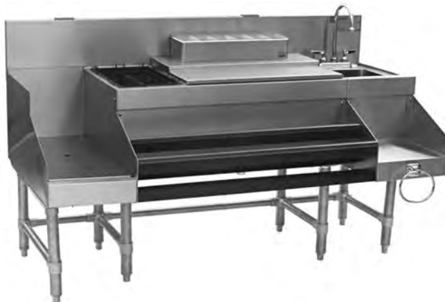
combination cocktail station

Eagle Spec-Bar® Combination Cocktail Station; model _____. Heavy gauge type 304 stainless steel body, legs, leg channels and cross rails. Models offered with (12" or 18") recessed workboard with 1½" drain and stainless steel removable perforated insert, or with (12" or 18") tiered liquor display with ABS for sound deadening—#CCS-72 has both. (36" or 42") combination foamed-in-place insulated ice chest with bottle holders. Two ¾" x 2½" tubing access holes in top of backsplash. Dry waste chute. Condiment dispenser. 12" single wet waste sink with T&S faucet and perforated plastic lift out strainer. Stainless steel blender shelf with towel ring and rear cord access hole. Stainless steel double speed rail with ABS for sound deadening, and stainless steel adjustable bullet feet.