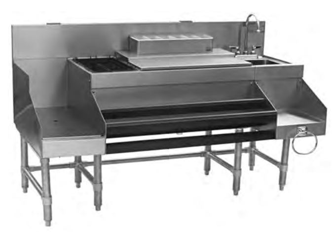
combination cocktail station

Eagle Spec-Bar® Combination Cocktail Station; model _______. Heavy gauge type 304 stainless steel body, legs, leg channels and cross rails. Models offered with (12" or 18") recessed workboard with 1\frac{1}{2} " drain and stainless steel removable perforated insert, or with (12" or 18") tiered liquor display with ABS for sound deadening—#CCS-72 has both. (36" or 42") combination foamed-in-place insulated ice chest with bottle holders. Two \frac{1}{2} " tubing access holes in top of backsplash. Dry waste chute. Condiment dispenser. 12" single wet waste sink with T&S faucet and perforated plastic lift out strainer. Stainless steel blender shelf with towel ring and rear cord access hole. Stainless steel double speed rail with ABS for sound deadening, and stainless steel adjustable bullet feet.