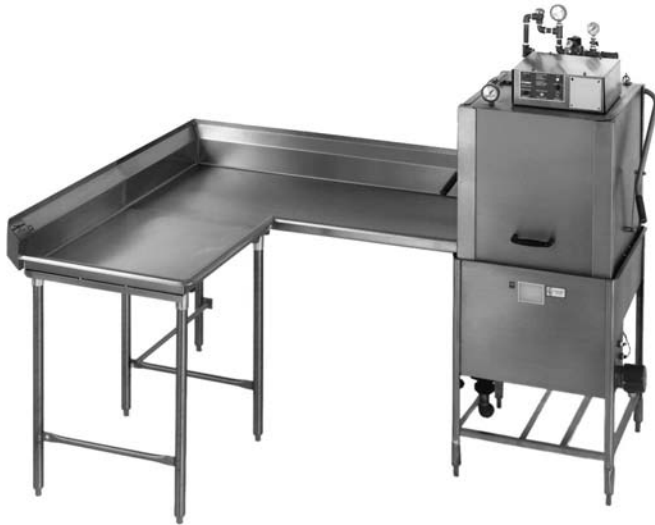
left-hand model shown (dishwasher not included)

Eagle Clean Dishtables, model _____. Top to be 16/430, 16/304, or 14/304 stainless steel, with all seams welded, ground smooth, and polished. Front and ends to have 3"-high upturn with 1½"-diameter rolled edge. Galvanized hat channels welded to underside. Backsplash is 8"-high, 20½" standard opening for dishwasher. Legs to be 1½" O.D. galvanized tubing, 1" diameter crossbracing and adjustable bullet feet (14/304 models come standard with stainless steel hat channels welded to underside of table, stainless steel crossbraced legs, and adjustable metal feet).