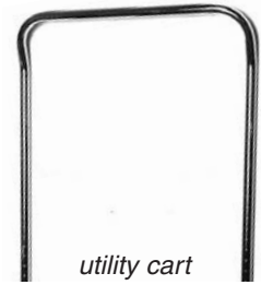
utility cart handle