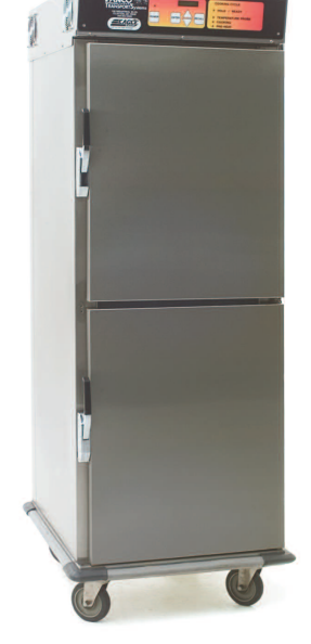
full-height unit with dutch doors