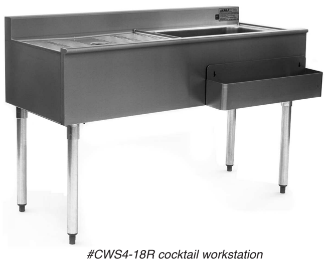
#CVV34-TON COCKIAII WOTKSIAIIOT