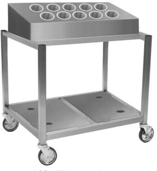
#DCS2-TPU tray platform unit