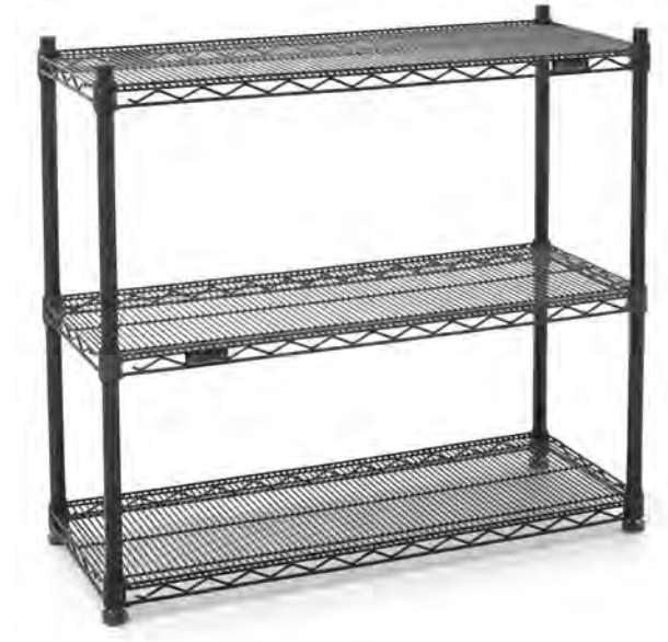
double-mat wire shelves shown assembled with 33" (838mm) posts *

Eagle Double Mat Wire Shelving, model _____. (EAGLEbrite® Zinc, Valu-Master® Grey Epoxy, Valu-Gard® Green Epoxy, White Epoxy, Red Epoxy, Black Epoxy) open wire grid with patented QuadTruss® design. Wire shelf with %6% spacing between the mat wires to accommodate bubble bottom plastic bottles.