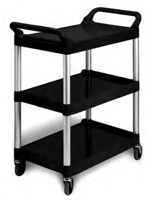
black polymer utility cart