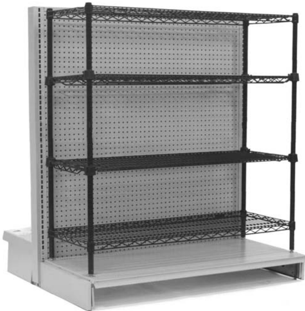
gondola with Gondola Inset Add-A-Shelf®

Eagle Freestanding Gondola Inset Adjustable Reverse Mat Add-A-Shelf® Wire Shelving, model _____. (EAGLEBrite® Zinc, Chrome, Black, Red, White) reverse mat Add-A-Shelf® with a built in ledge. 300-lb. weight capacity.