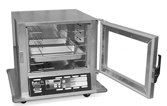
extended undercounter heated cabinet with clear polycarbonate door

Eagle Extended Undercounter Heated Cabinet, model ______. Aluminum interior and exterior, patented TEMP-GARD® air flow design, (insulated/non-insulated), bottom mount control panel, door (solid, or with polycarbonate window), and adjustable digital temperature control system with LCD readout. Removable (wire/universal wire) slides on 2¼" standard spacing, full perimeter bumper, 8' cord & plug, and 3"-diameter heavy duty polymer swivel casters, two with brakes.