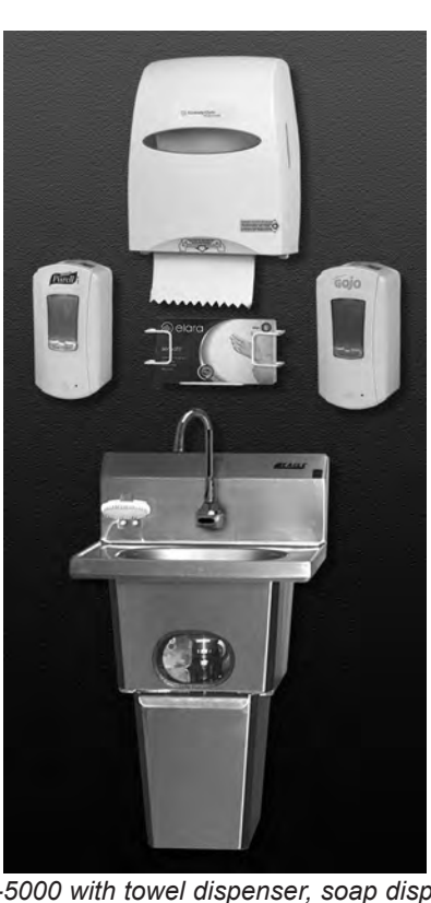
#HFL-5000 with towel dispenser, soap dispenser, hand sanitizer dispenser and glove box holder