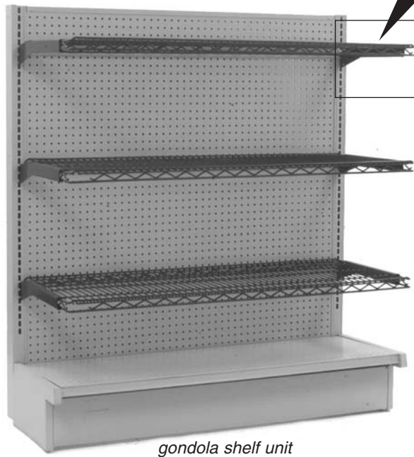
gondola shelf unit